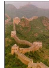
Great Wall of China

Can you think of some other Famous Structures ?