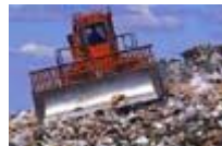
Non-Living Resources - Landfill