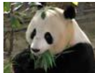
Living Resources - Zoo