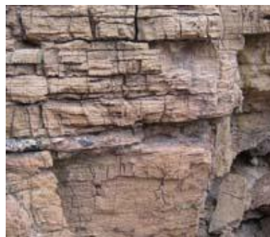
Sedimentary Rock Layers