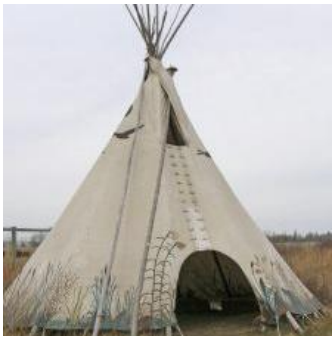
Traditional Native Structure